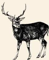
Red & Fallow Venision