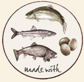
77% hereof 55% fresh