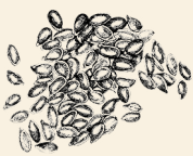
British Grown Linseed