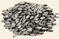
Brown Rice Protein